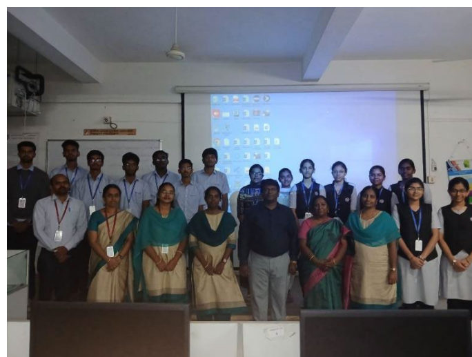
Group Photo of the patent workshop